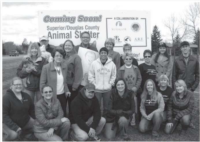
Staff and volunteers from AAHS and HSDC gather at the Coming Soon sign for the proposed Superior adoption center to show their support for project.

After five long years and many meetings, plans are coming together for the City of Superior and Douglas County to build an adoption center on the corner of U.S. Highway 2 and Moccasin Mike Road. This new, state-of-the-art building will provide a larger, more comfortable and welcoming space for animals and visitors alike than the current shelter located on Hill Avenue in Superior. This facility will also provide adequate space to serve all the homeless cats and dogs of Douglas County. Animal Allies Humane Society will manage the new facility, whose operations will be modeled on Duluth's successful shelter programs.