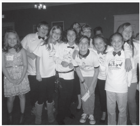
Youth Allies at Fur Ball

along with the energy and enthusiasm of the other youth, inspired attendees of the Fur Ball to donate over $11,000 that night! We are so grateful for the support of Fur Ball attendees, who recognized that the way to build a caring community is by teaching young citizens to treat animals with compassion and respect. Thank you all for sharing this special night with us.