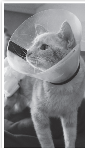
Barbra stands up to stretch her legs in her kennel.

At the time this story was written, the outlook for these four little lives improved vastly. Barbra’s wound is healing nicely and she tolerates her bandage changes very well. The three little kittens have been growing steadily, and the foster volunteer caring for them reports that even their timid adoptive mother cat is beginning to come out of her shell. In just a few short weeks, with the touch of many caring hands, another four lives were saved.