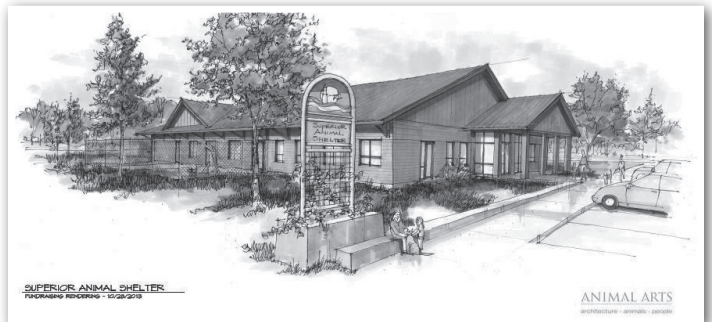
Architectural rendering of the proposed shelter.