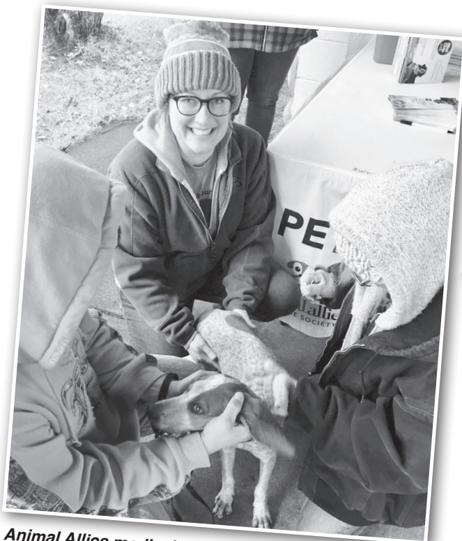
Animal Allies medical staff administer a microchip at the Cloquet event.