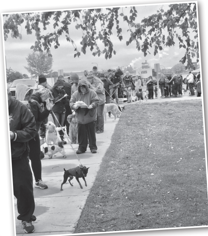
Pet owners wait in line at the Cloquet tag and chip clinic.

Following the success of chip and tag events this fall in Cloquet and at Bent Paddle Brewery in Lincoln Park, Animal Allies will offer a clinic on Wednesday, December 19 at the West Duluth Senior Center in Spirit Valley. Dogs and cats can also get chipped at Animal Allies by appointment.