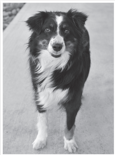
Maxine, a 7 year old Australian Shepherd, found a home in April.

The Campaign for Zero aimed to eliminate euthanasia of healthy cats and dogs entering both Animal Allies Humane Society and the City of Duluth Shelter. On January 1, 2011 this campaign was pronounced a success. Since then, saving the lives of every healthy pet continues to be achieved by progressive spay/neuter, adoption, and humane education initiatives.