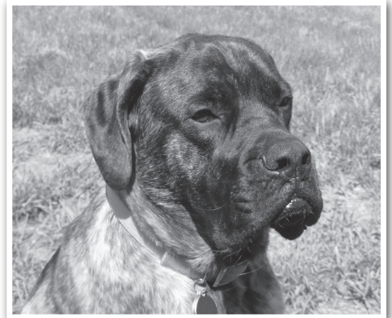
Deja enjoys the sunshine as she relaxes in her yard. The Mastiff was overjoyed to be reunited with her family after being lost for almost six months.

A quick phone call to her owners revealed a miraculous story. Deja had been missing for over six months! Tears of joy flowed freely as Deja's family came to collect her. They had thought they would never again set eyes on their beloved dog.