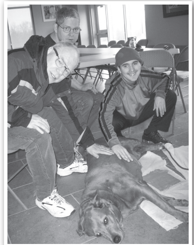
Ginger enjoys some attention from the UDAC artists.