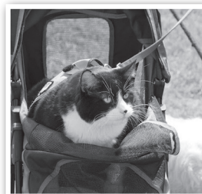
Gnome loved the Walk for Animals!

The 2012 Walk for Animals raised over $28,000 for Animal Allies' adoption, spay/neuter, and humane education programs. Thank you to all who made this year's event a success!