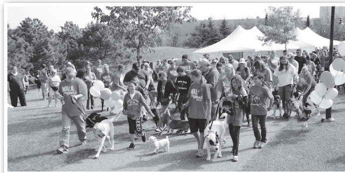
Grand marshals kick off the walk.

Beautiful weather plus fabulous supporters equals success for homeless pets!