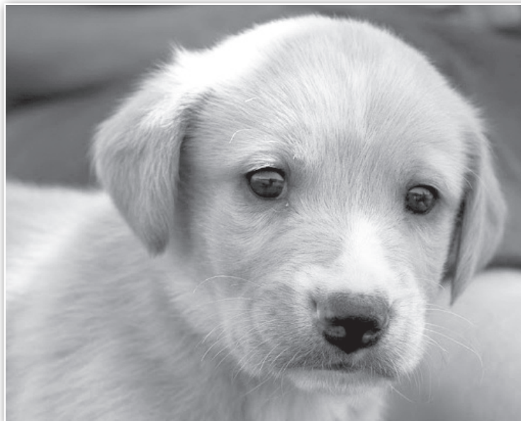
Kit Kat

We can help these animals and maintain our commitment to local homeless pets. From transports in partnership with rescues in the area, to transports from southern states like Alabama and Tennessee, what matters most is the smile on an adopter's face when they leave the lobby with their new best friend, the happy face of a contented dog who is safe and fed, and the success of another life saved.