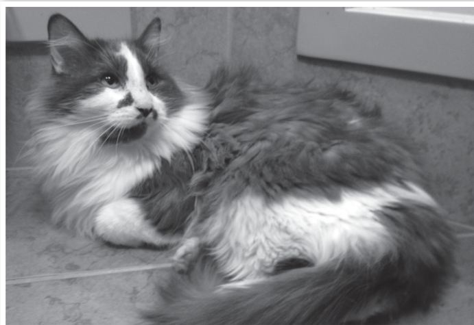
Tabbart, one of over 65 felines rescued from a Duluth home