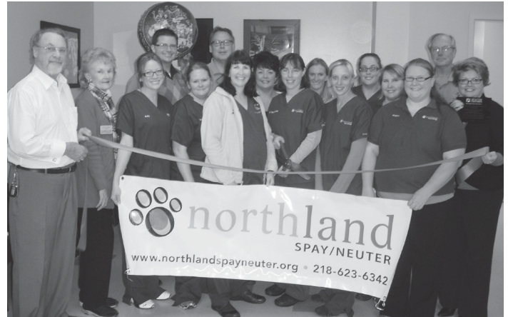
Ribbon Cutting Ceremony on October 17th

The Northland Spay/Neuter program is supported in part by contributions to Animal Allies from individuals, families, and area businesses. The program also receives